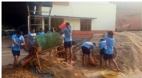
Shramadhana by Our Students