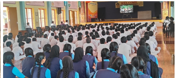
Our Students Watched the live Telecast of "Pariksha Pe Charcha" at Our School. It was an Enriching and Motivating Session where they received valuable Guidance on exam Preparation, Stress Management, and Positive Thinking from our Hon'ble Prime Minister.